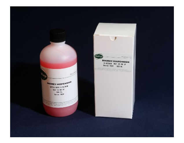
Diamet self lubricating diamond suspension

MetPrep Technical Bulletin 0020 - 2015. For further information please contact sales@metprep.co.uk MetPrep Ltd - Curriers Close, Charter Avenue, Coventry, CV4 8AW - 02476 421222