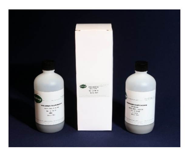
Polymet special formula diamond suspension