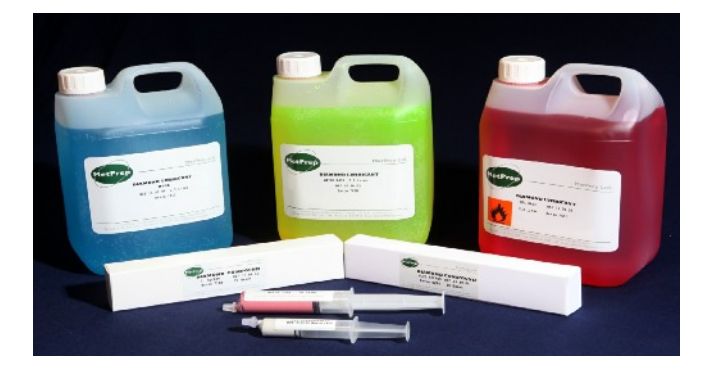
Monocrystalline & Polycrystalline paste + Alcohol based - Water Based & Oil based lubricants