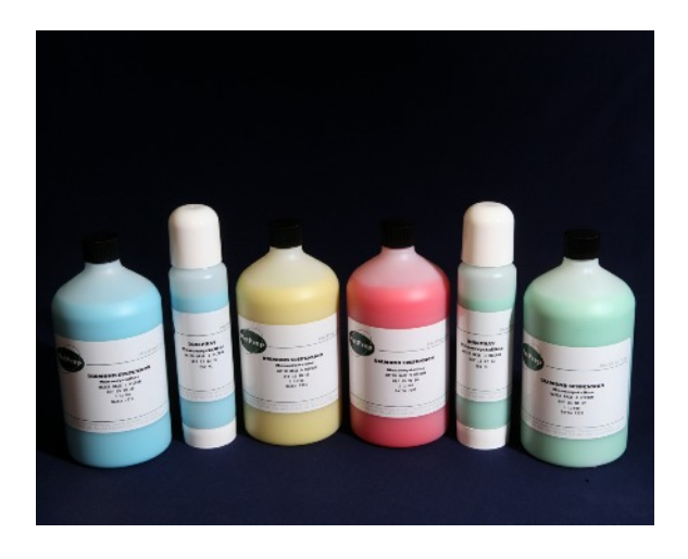
Monocrystalline Diamond Suspensions