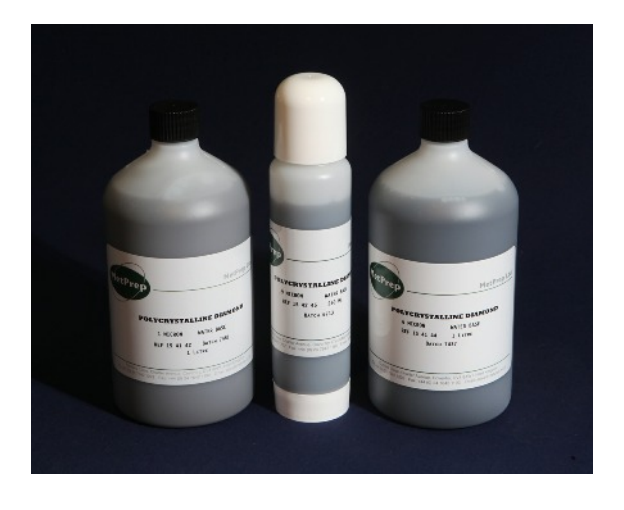
Polycrystalline Diamond Suspensions